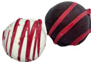
TRUFFLE PUPCAKE: $2.25