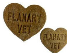
LARGE $1.25 SMALL $0.50