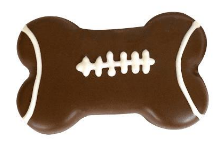
PEANUT BUTTER CUP $1_75